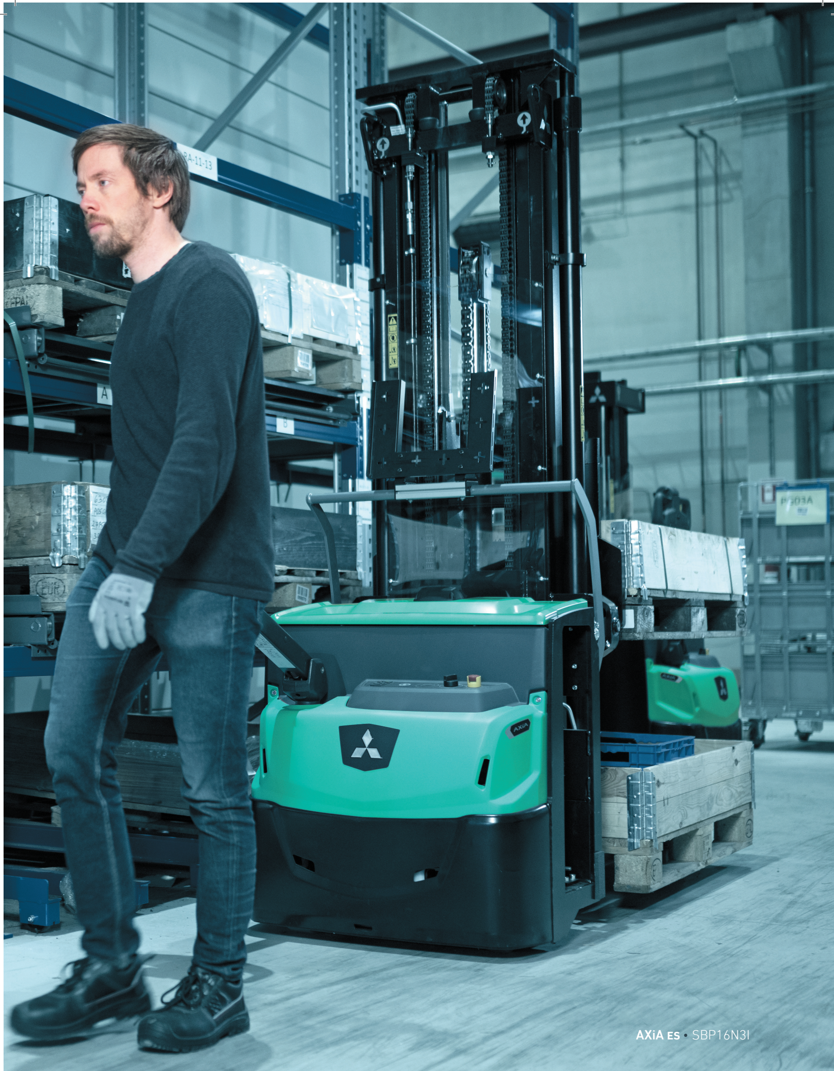
AXiA ES • SBP16N3I