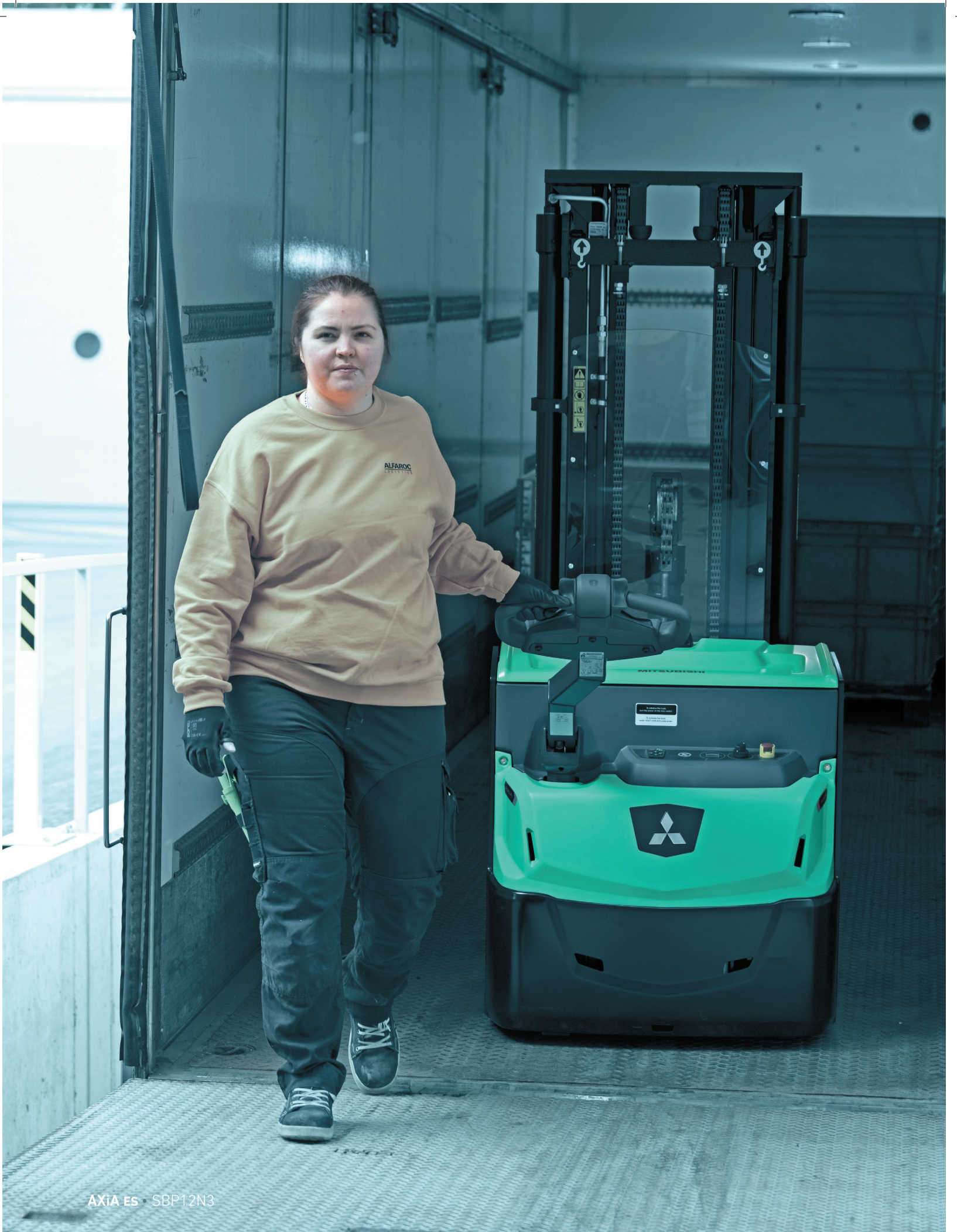
AXIA ES · SBP12N3