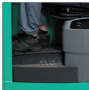
Adjustable floor plate