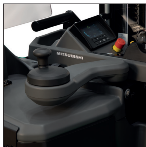
Adjustable steering wheel