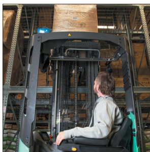
Panoramic ProVision roof