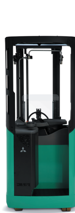
AXiA EX • SBR16N2

With capacities up to 2 tonnes, stand-in and sit-on stacker models are a lower-cost option when lifting up to 7m as reach trucks can often be over-specified for these jobs.