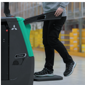
Foldable side bars (Option)