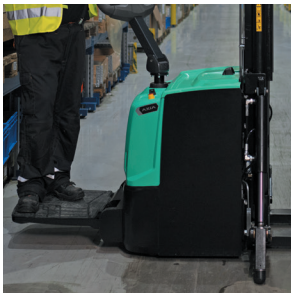
Folding platform & side stabilisers