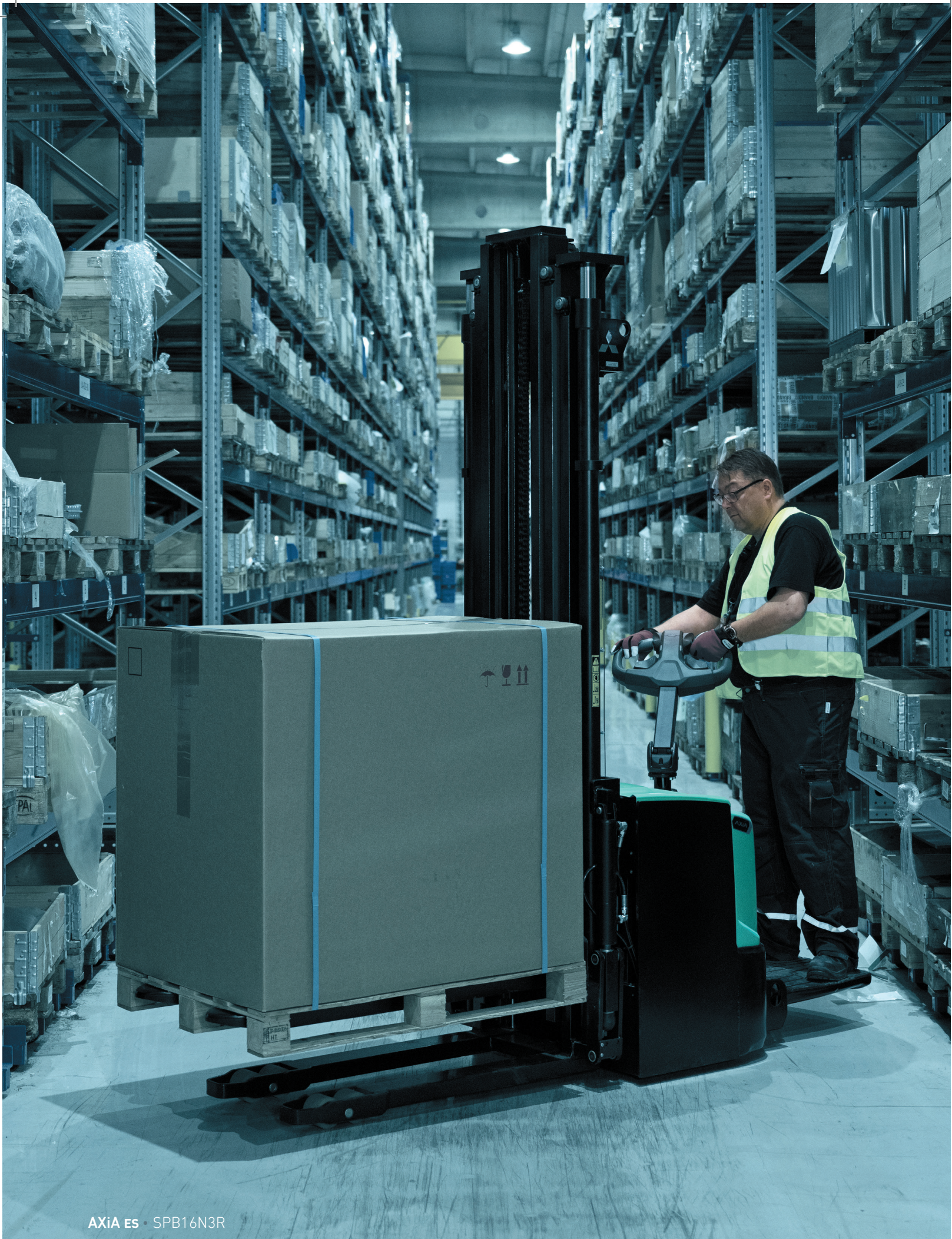
AXiA ES · SPB16N3R