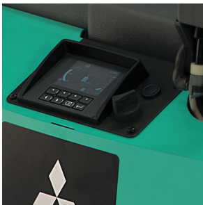
Multifunctional display (SBP12N2C)