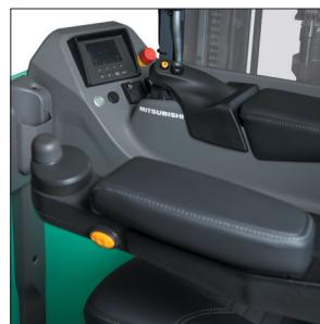
Mini steering wheel with floating armrest