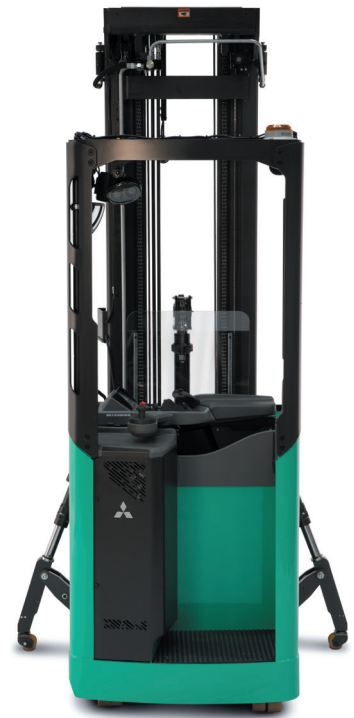
AXiA EX • SBR20N2