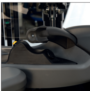
Ergonomic handle with drive control