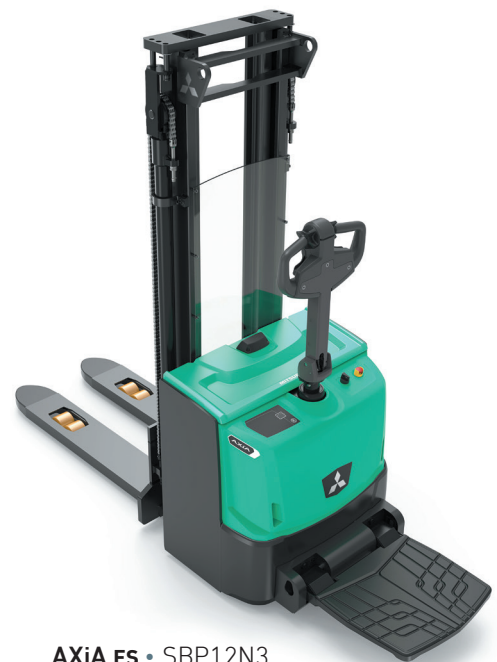
AXIA ES • SBP12N3