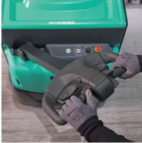
Easy-to-operate tiller arm