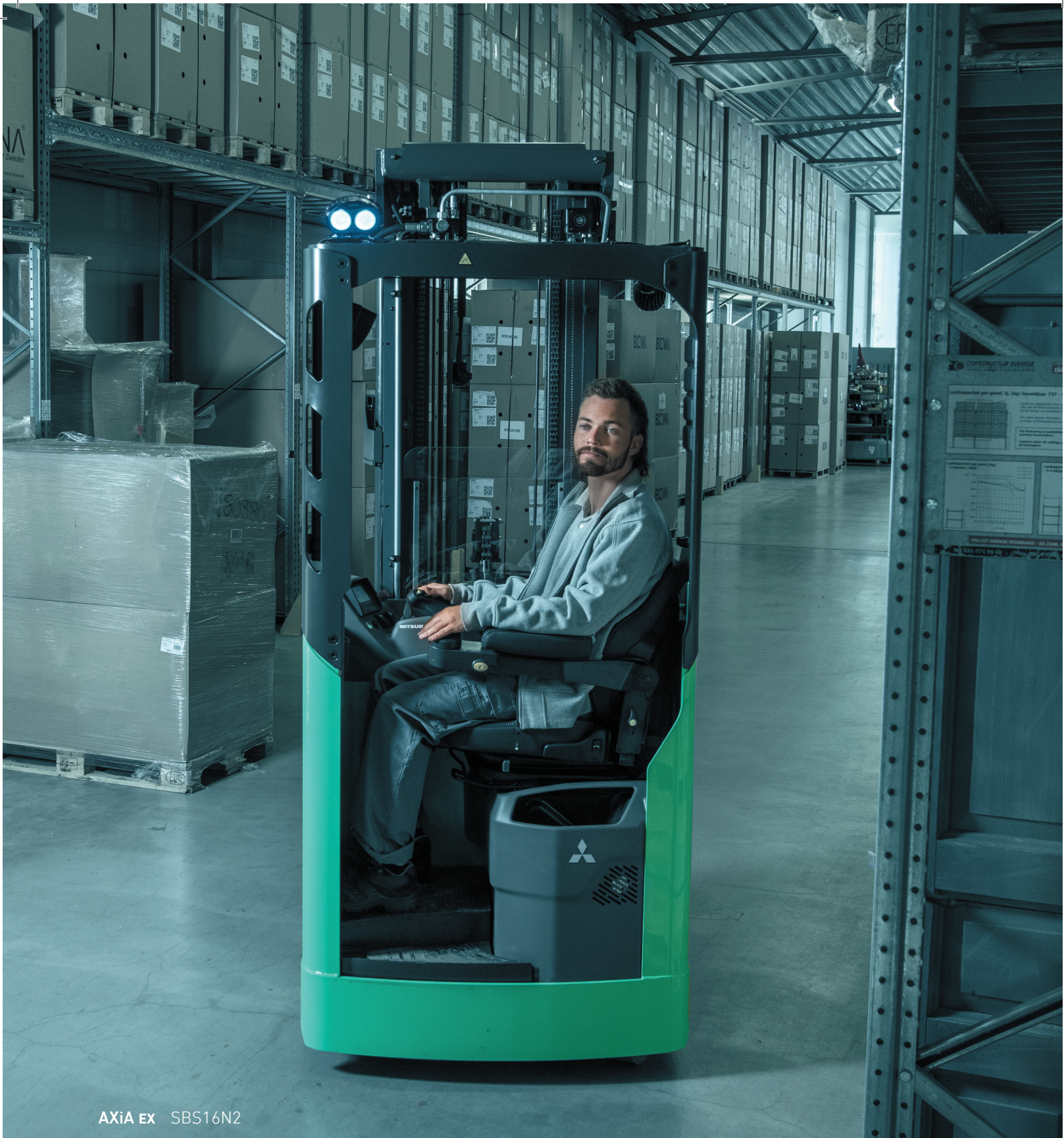
AXiA EX SBS16N2